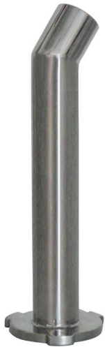
Open applicator for skin treatment

Efficient application for superficial and intra-operative x-ray therapy